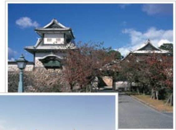
Kanazawa Castle Park